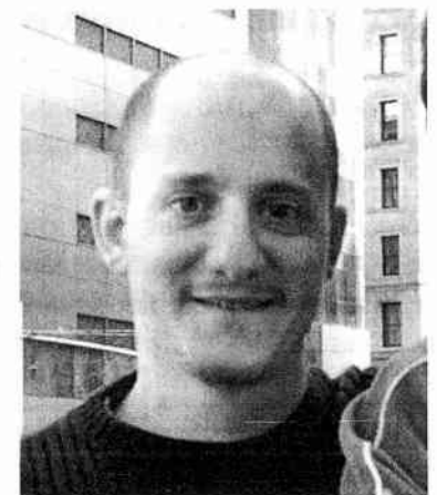
Zohar, then and now