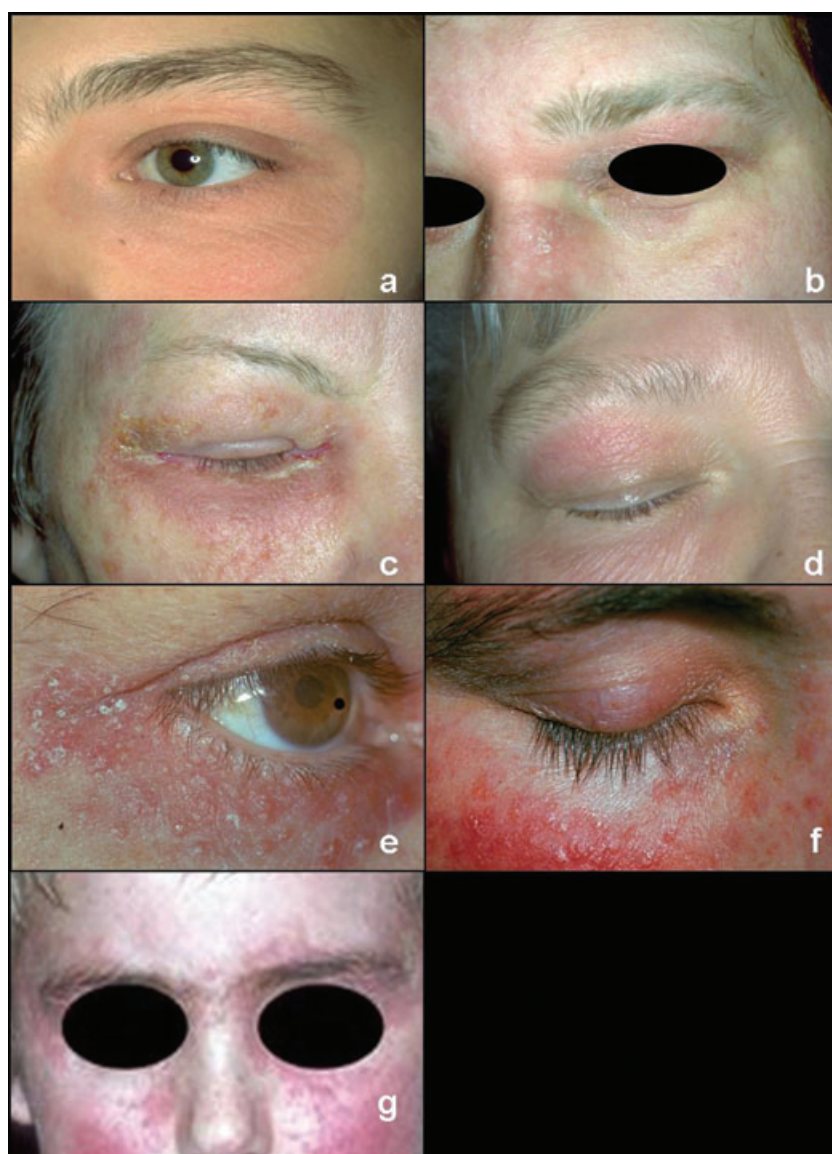
Figure 2: Periorbital atopic eczema (a, b), periorbital allergic contact dermatitis (c, d), periorbital rosacea (e, f), periorbital psoriasis (g).

be taken and appropriate patch tests should be performed. The reader is referred to the guidelines of the German Society of Dermatology on “Contact Dermatitis” [14] and “Performing a patch test with contact allergens” [15]. Type IV hypersensitivity to nickel (II) sulfate is the most prevalent sensitization in the general population and is also commonly associated with periorbital dermatitis, regardless of whether it is relevant [15] to the dermatitis in question (Valsecchi et al.: 52 % periocular versus 25.5 % of total sample; Cooper & Shaw: 17.2 % periocular versus 15.9 % of total sample; Nethercott et al.: 13.5 % periocular versus 10.2 % total sample) [4, 5, 16]. At least one large study (n = 49,256) has found, however, that positive patch tests to nickel (II) sulfate were no more common in patients with allergic periorbital dermatitis than among patients with non-allergic periorbital dermatitis [7]. Although nickel (II) sulfate was the most commonly associated type IV allergy (19.5 %), it was only rarely (< 1 %) believed to be a clinically relevant cause of periocular dermatitis in a case-related assessment of relevance [1].