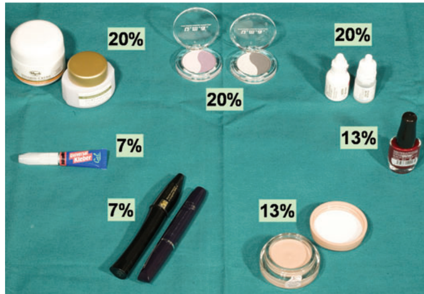
Figure 3: Hit list of consumers' products, which were elicitors for periorbital allergic contact dermatitis or airborne dermatitis (Department of Dermatology, University Hospital Erlangen 1999–2004): facial cream, eye shadow, ophthalmologic medications, nail polish, make-up, mascara, glue.

In one study, in 31% of patients with periocular allergic or airborne contact dermatitis, the patients' personal products (face cream 20%, eye shadow 20%, ophthalmologic medications 20%, nail polish 13%, make-up 13%, mascara 7%, glue 7%) were identified as the relevant contact allergen source [1] (Figure 3). In 12.5% of patients with allergic or airborne allergic contact dermatitis, the triggers could only be diagnosed by conducting tests using the patients' own personal products, and not by patch testing of commercial selected series based on the patient's medical history. Possible contact allergens include preservatives and fragrances (including those which must be listed as well as those which are exempt) [25]. If patch testing with the patient's own personal